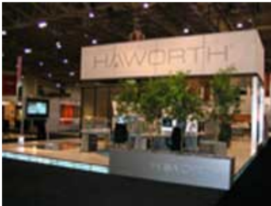
Above: The Haworth Booth at IDEX/ NeoCon